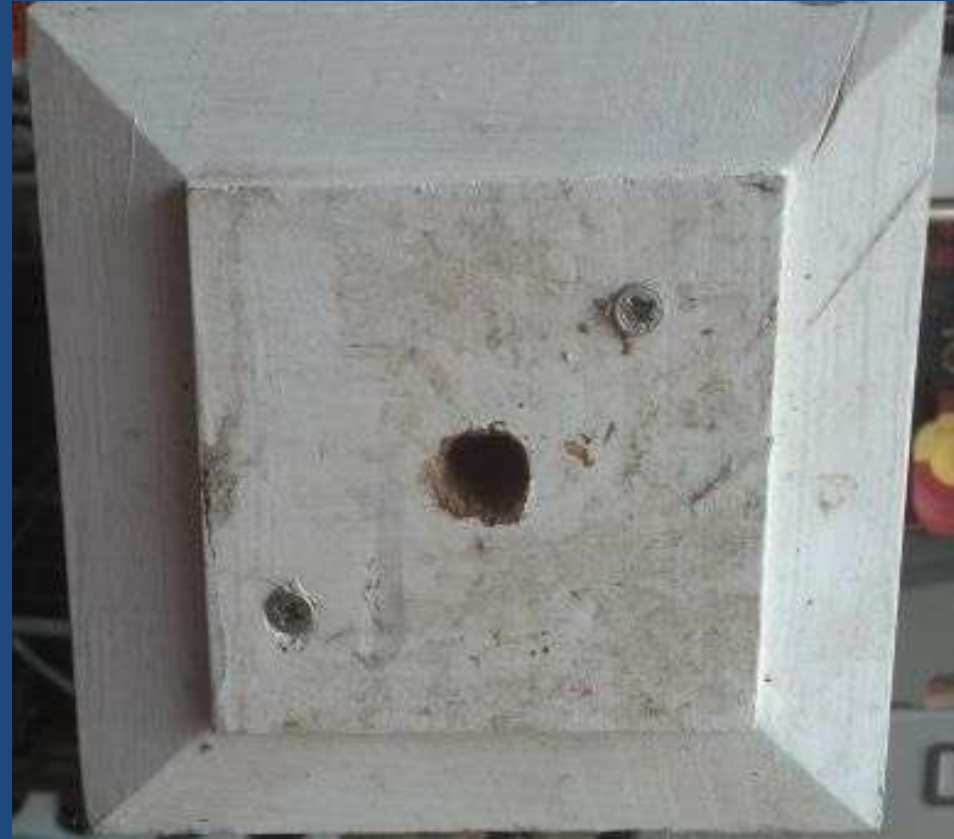
Vegetable Cutting Stand